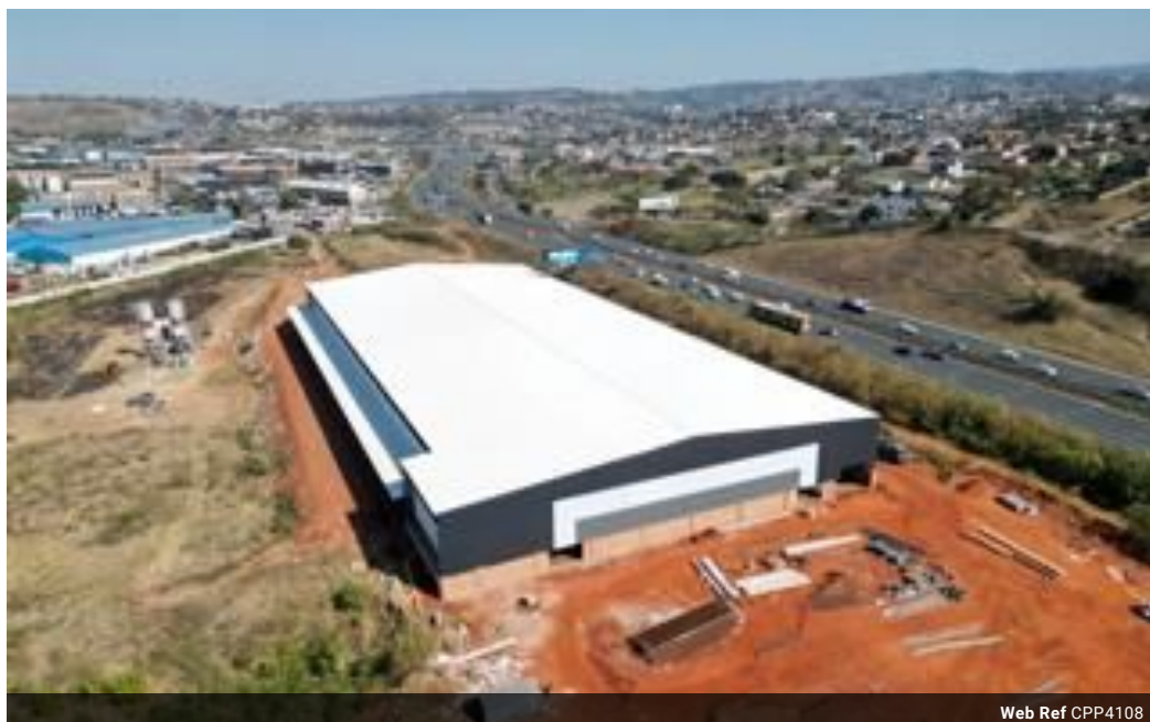
Web Ref CPP4108

Shop 5 7 on Millennium Boulevard Umhlanga Ridge 4321