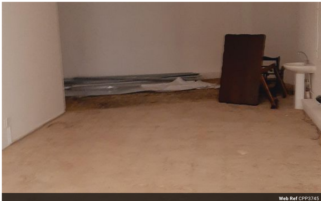
Web Ref CPP3745

Shop 5 7 on Millennium Boulevard Umhlanga Ridge 4321