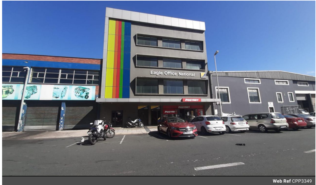
Web Ref CPP3349

Shop 5 7 on Millennium Boulevard Umhlanga Ridge 4321