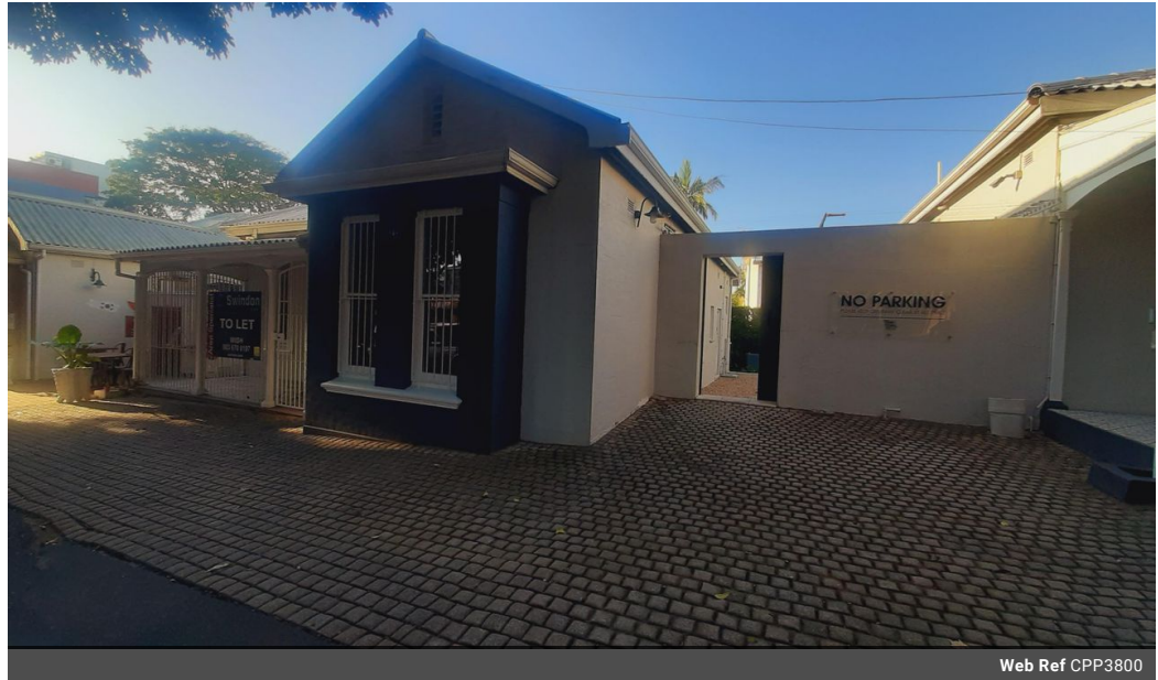
Web Ref CPP3800

Shop 5 7 on Millennium Boulevard Umhlanga Ridge 4321