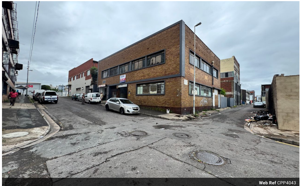
Web Ref CPP4043

Shop 5 7 on Millennium Boulevard Umhlanga Ridge 4321