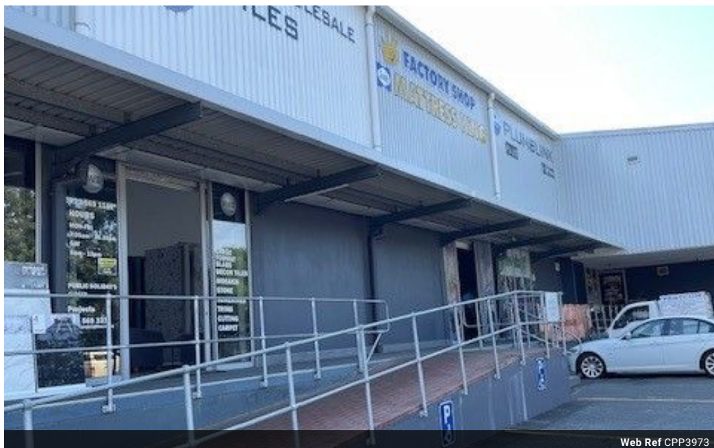
Web Ref CPP3973

Shop 5 7 on Millennium Boulevard Umhlanga Ridge 4321