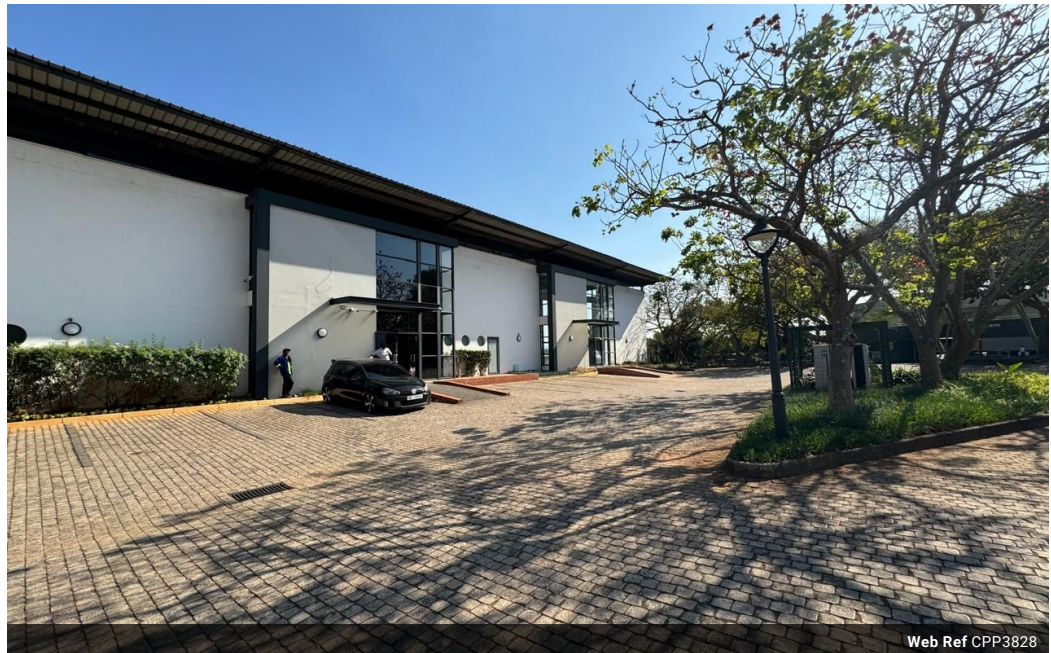
Web Ref CPP3828

Shop 5 7 on Millennium Boulevard Umhlanga Ridge 4321