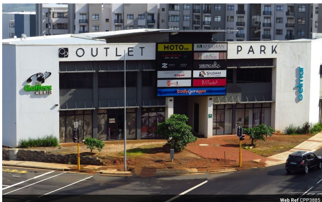
Web Ref CPP3885

Shop 5 7 on Millennium Boulevard Umhlanga Ridge 4321