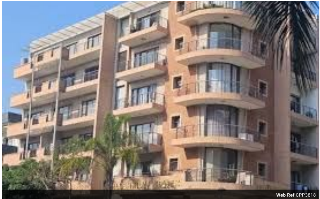
Web Ref CPP3818

Shop 5 7 on Millennium Boulevard Umhlanga Ridge 4321