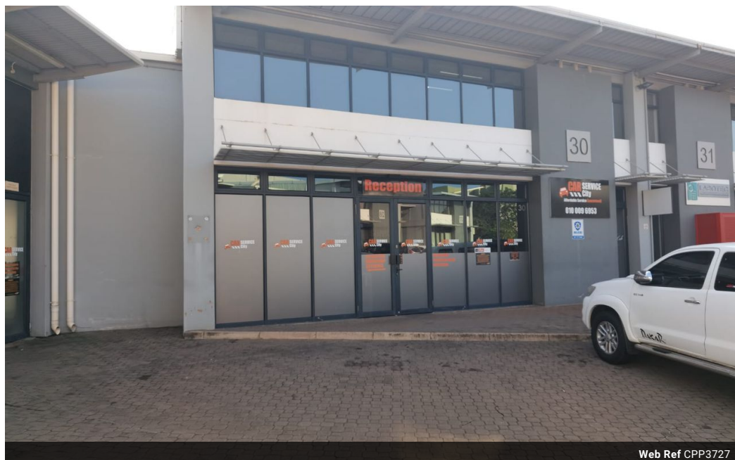
Web Ref CPP3727

Shop 5 7 on Millennium Boulevard Umhlanga Ridge 4321