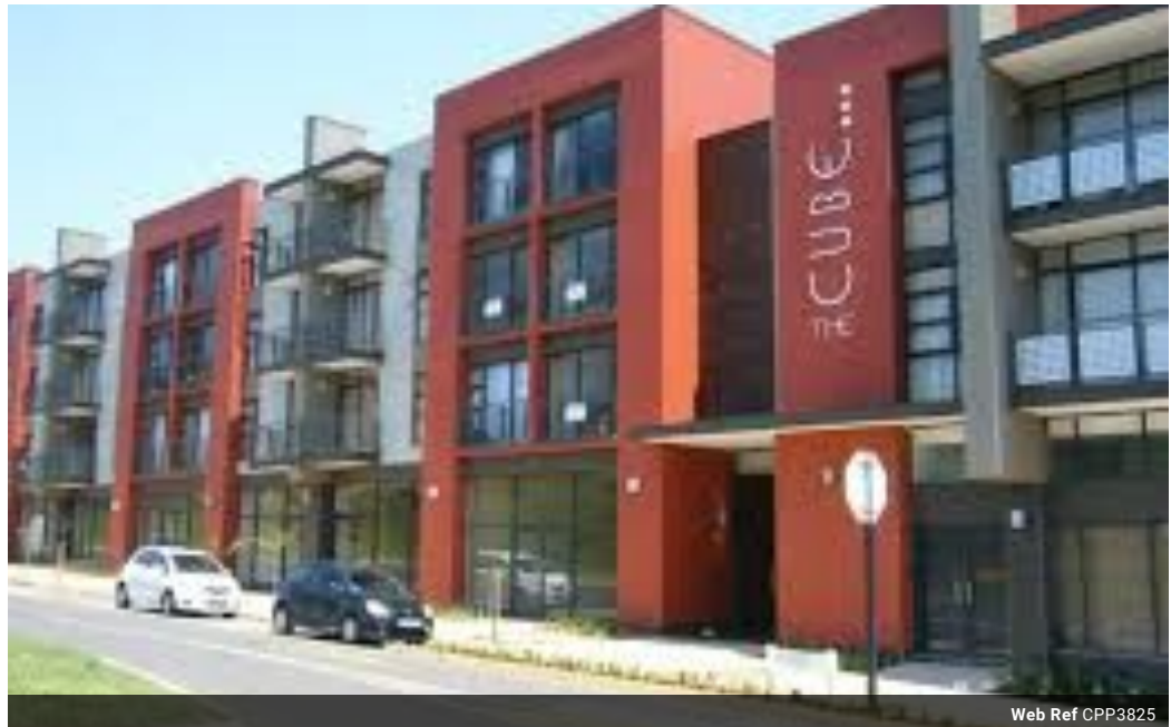
Web Ref CPP3825

Shop 5 7 on Millennium Boulevard Umhlanga Ridge 4321